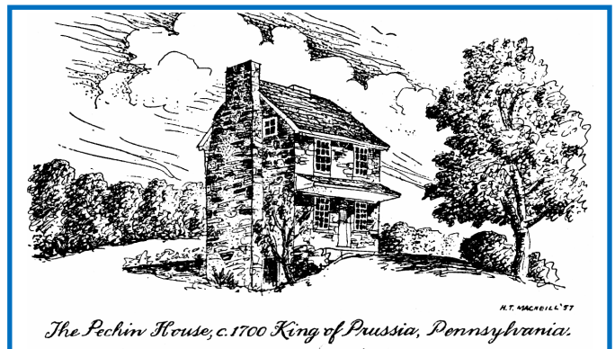
The Pechin House, c.1700 King of Prussia, Pennsylvania.