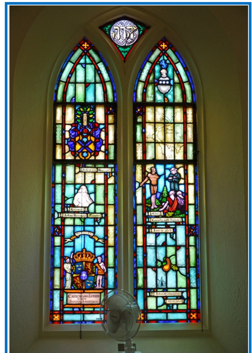
Two windows in Old Swedes.

Paula Himmelsbach Balano was active until the age of 82 and died in 1967.